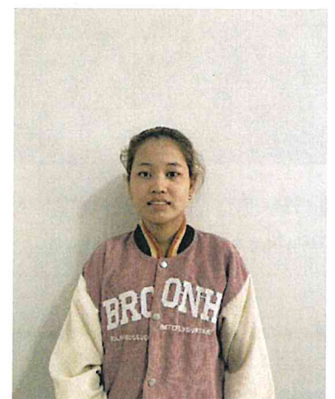
MAO SEIHA ACCOUNTING